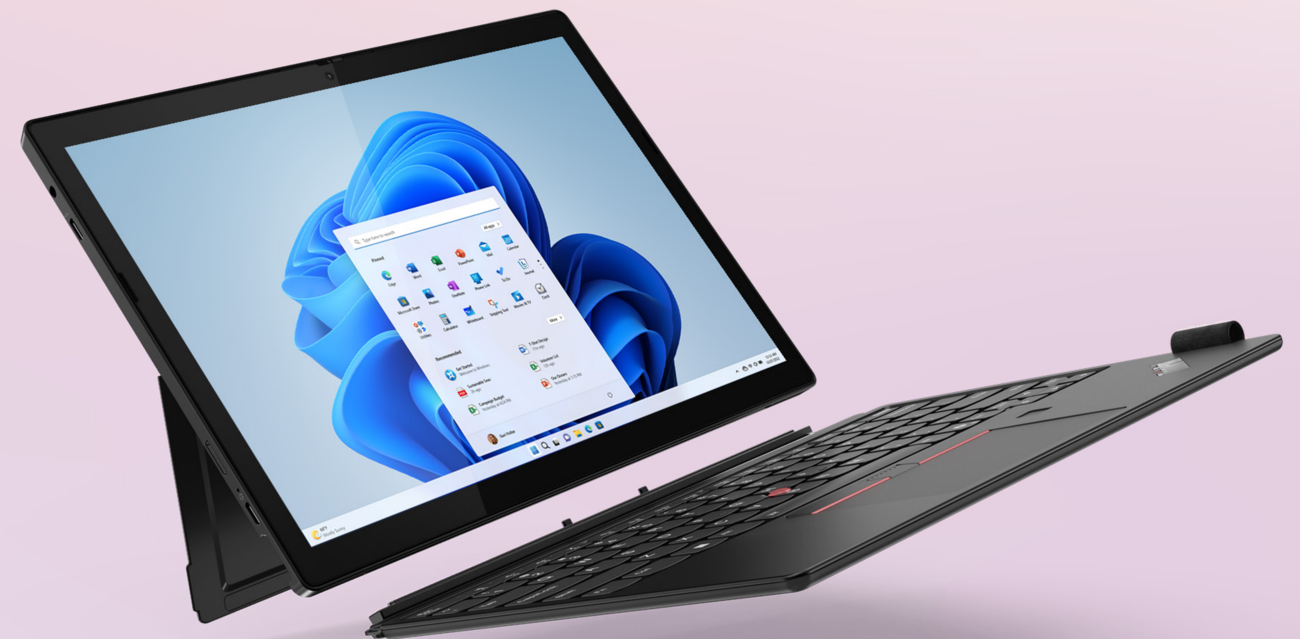
ThinkPad X12 Detachable

Learn more at techtoday.lenovo.com/education