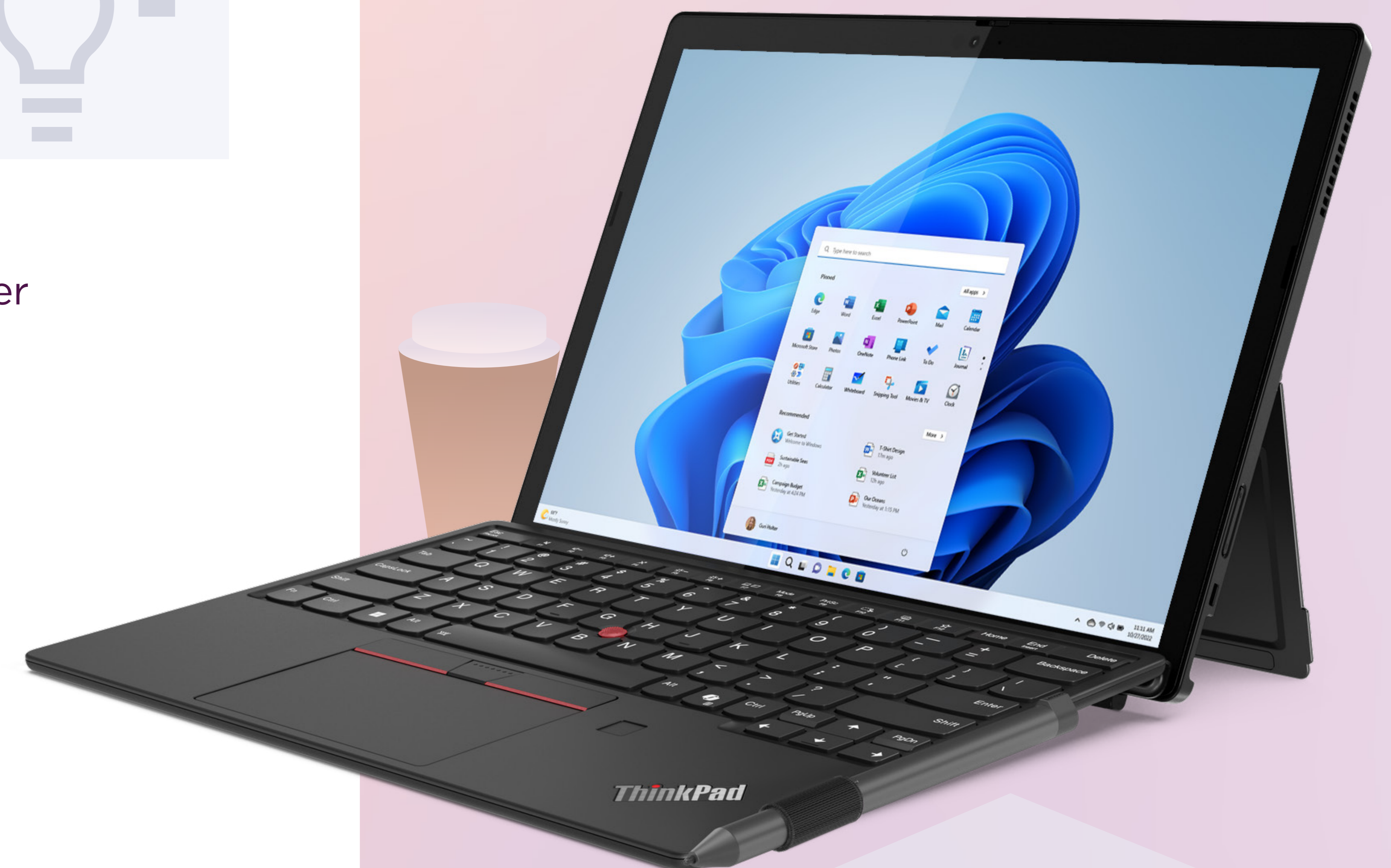
ThinkPad X12 Detachable

From our laptops, 2-in-1s, and rugged tablets to our powerful workstations, Lenovo delivers a wide range of robust devices built for education challenges at every level. For example, the ThinkPad X12 Detachable built on Intel® vPro® platform with Intel® Core™ Ultra processor and running on Windows 11 Pro delivers new AI capabilities and immersive visuals to elevate the learning experience to a whole new level. Improve student focus with a simpler user experience, including centered Start, clean layout, and easy navigation.