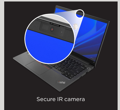
Secure IR camera